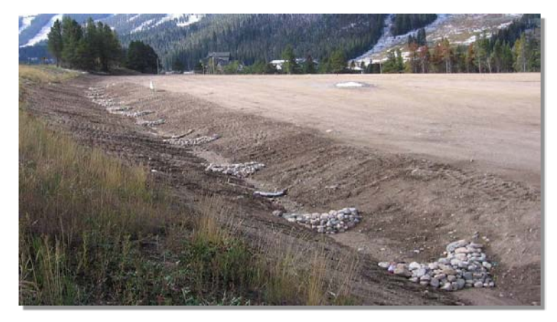
Photograph CD-1. Rock check dams in a roadside ditch.

Check dams are temporary grade control structures placed in drainage channels to limit the erosivity of stormwater by reducing flow velocity. Check dams are typically constructed from rock, gravel bags, sand bags, or sometimes, proprietary devices. Reinforced check dams are typically constructed from rock and wire gabion. Although the primary function of check dams is to reduce the velocity of concentrated flows, a secondary benefit is sediment trapping upstream of the structure.